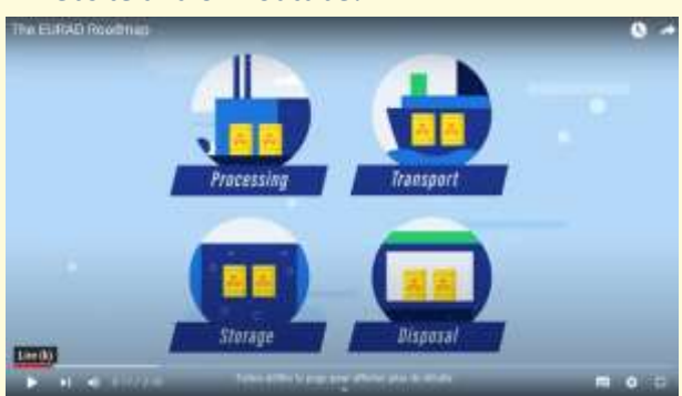
Click on the picture to access the video <a href="https://www.youtube.com/watch?v=B">https://www.youtube.com/watch?v=B</a> VyoQ BwrU

In EURAD we are often referring to the Roadmap, go find out more with this new explaining video available on the EURAD website and on Youtube!