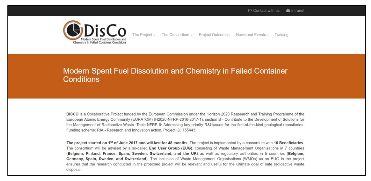
Figure 1. Screenshot of the DisCo homepage.

The project webpage has been set up and it is accessible to project participants since July 2017 at the following address: <a href="https://www.disco-h2020.eu/">https://www.disco-h2020.eu/</a>. A screenshot of the home page is shown in Figure 1.