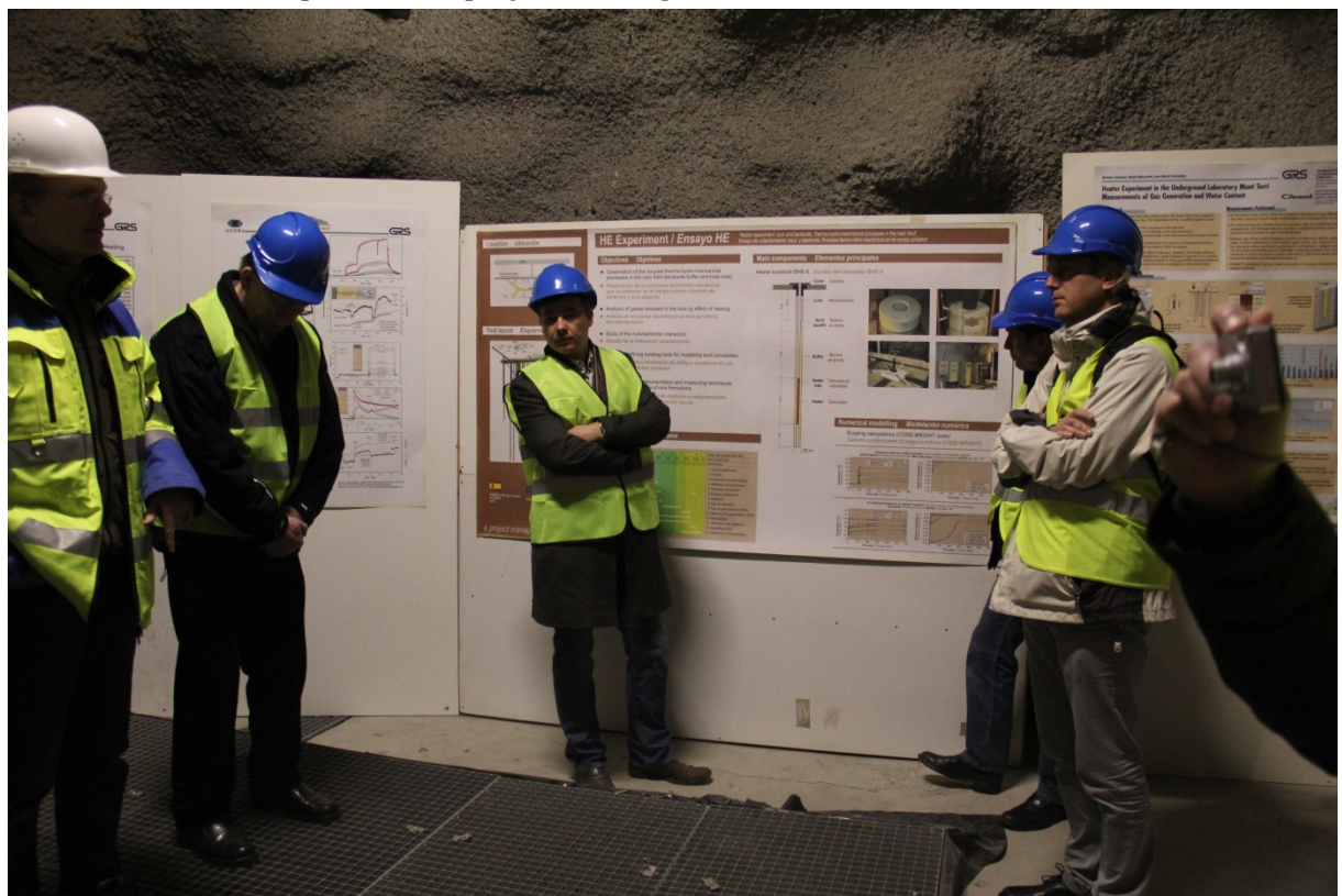
There were opportunities to explore the detail of these experiments ...

In the lab, the group was split up in two smaller groups, each receiving detailed explanations about various MoDeRn experiments and having the opportunity to read about others in the posters displayed throughout the lab.