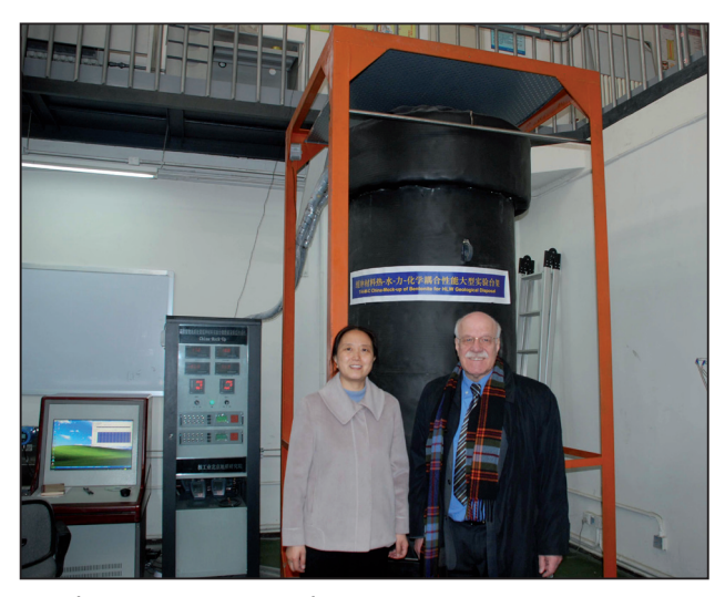
Mock-up at BRIUG Labs

to near-field processes, i.e. nuclear chemistry and physics, geochemistry, hydrogeology, mineralogy, geomechanics of clay, hard rock and rock salt, thermomechanics, mining engineering, in situ instrumentation, and modelling for all these disciplines.