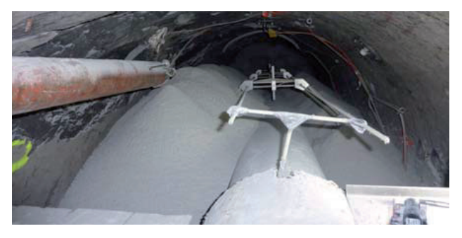
Figure 3. HE-E construction: emplacement of the MX80 pellets in the microtunnel in the Opalinus Clay at Mont Terri using the auger technique.

From the start of the experiment in June 2011 the heater surface temperature increased steadily and a temperature of 80°C was reached at the end of September 2011. At that time a hostrock/EBS temperature of 26°C was reached illustrating the strong temperature gradient within the EBS.