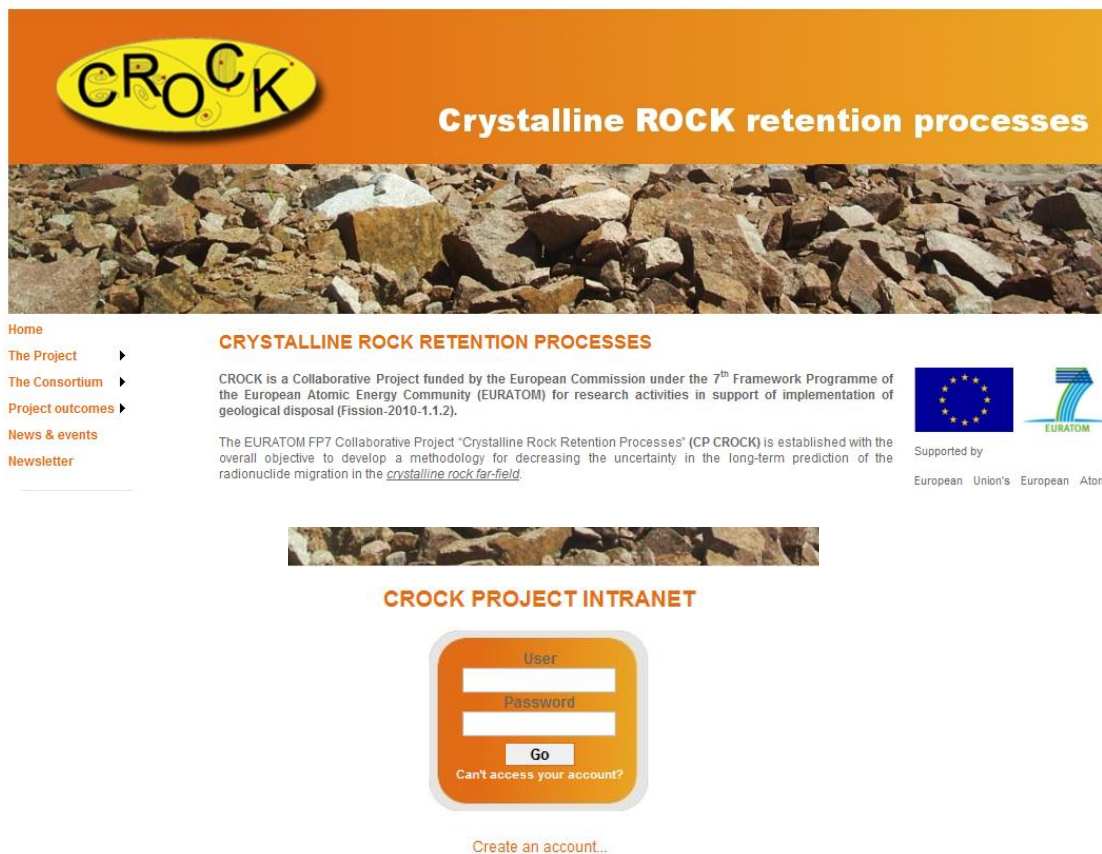
Figure 1. CROCK webpage ( www.crockproject.eu ) and internal intranet

The restricted access is an internal webspace "intranet" The intranet will serve as a tool for internal project communication and information exchange among the partners (see Figure 1).